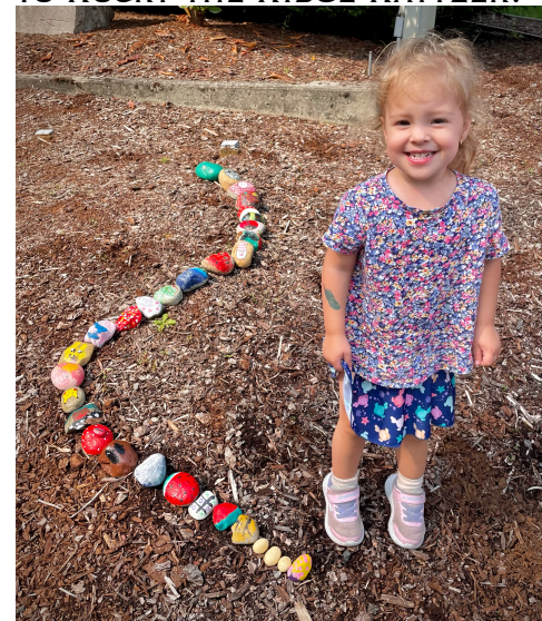
PIC BELOW- EVERLY ORTH ADDING A BEAUTIFUL ADDITION TO ROCKY THE RIDGE RATTLER!