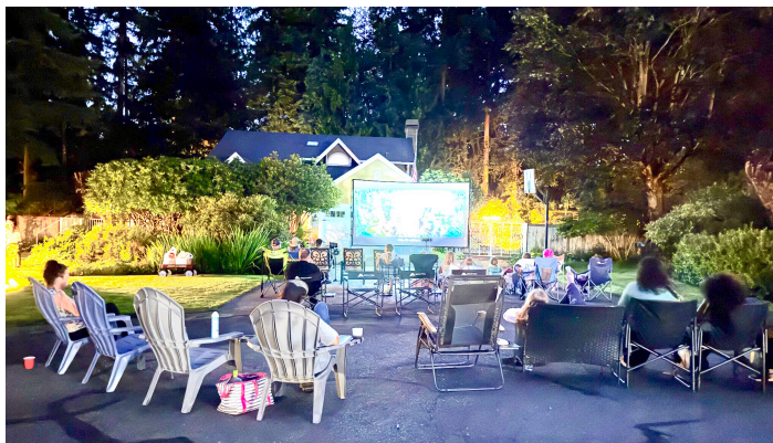
PIC LEFT- OUTDOOR MOVIE NIGHT!

Governing Document Updates will be added to the Annual Meeting Ballot. You'll soon receive a ballot in the mail regarding spending on needed changes to our governing documents. The ballot item is a request for approval to use savings for an attorney to review proposed changes. This is not a final vote on the changes themselves. It is just a step toward getting expert input before we proceed with a final vote.